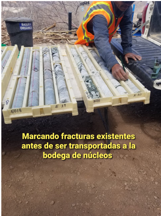
Marcando fracturas existentes antes de ser transportadas a la bodega de núcleos