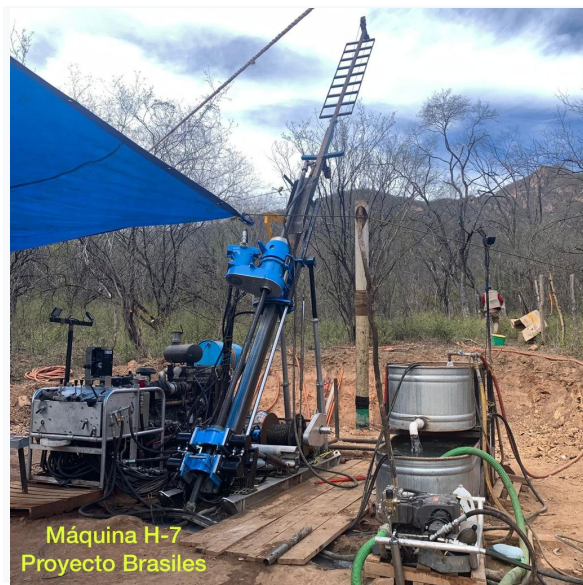
Máquina H-7 Proyecto Brasiles