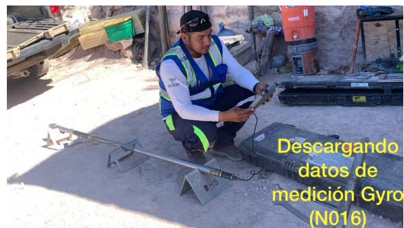
Descargando datos de medición Gyro (N016)