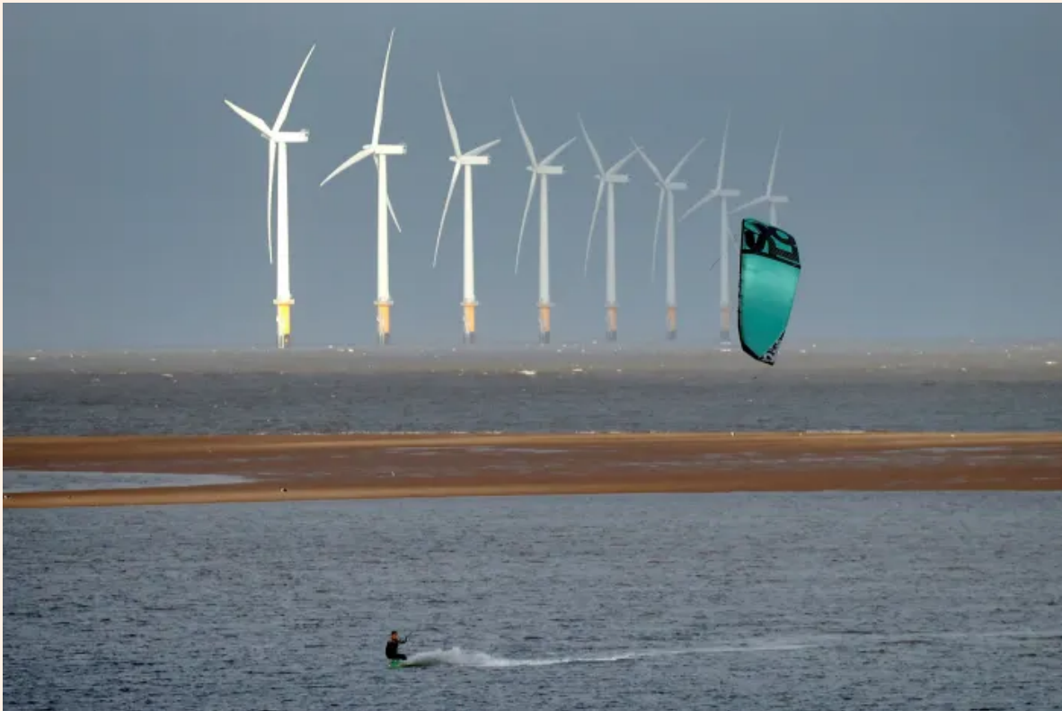
A kite surfer is pictured in front of the Burbo Bank offshore wind farm in Liverpool Bay on the west coast of the UK

“I also don’t think the China green capex numbers are fully appreciated,” he adds, “it’s $2tn a year for 40 years to get to net zero carbon. The numbers are mind blowing.”