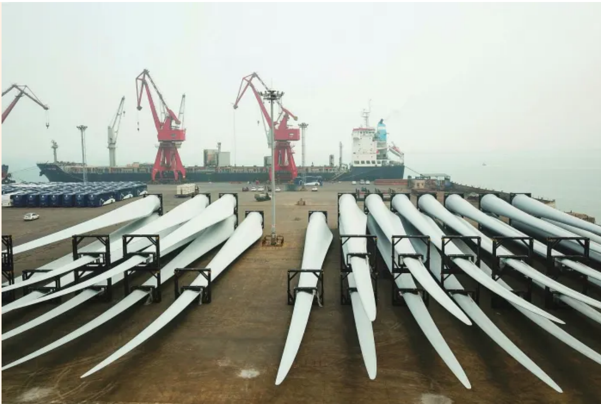
A 3-megawatt wind turbine uses up to 4.7 tonnes of copper

Unless that changes, Goldman sees an annual supply shortfall of 8.2m tonnes emerging by 2030. To put that figure in perspective, last year global refined copper production was 23.5m tonnes.