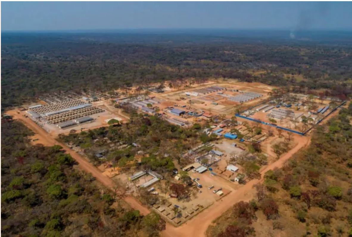
The Kamoakakula copper project in the Democratic Republic of Congo

“People look at the supply numbers, but they don’t filter in how difficult it is to get that supply,” says Farid Dadashev, co-head of European metals and mining at RBC Capital Markets. “The last time the copper price was high in 2011 and 2012 there were a couple of new projects in the market but they were all delayed and the capital expenditure was extremely high.”